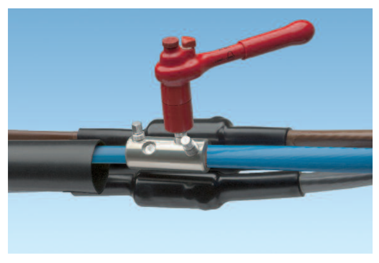
LJSM-PP Joints - Appropriate for Live-line-installations

All other sizes have also been completely tested in the TE Connectivity Raychem Laboratories in Ottobrunn/ Munich in Germany.