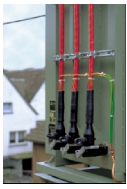
Screened Elbow Adaptors installed on outdoor SF<sub>6</sub>-transformer.

In addition, Rayvolve tubing or heatshrink phase-marking sleeves are offered as an option, to provide a superior environmental seal.